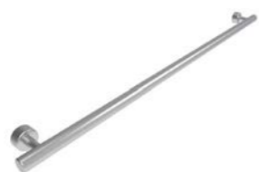
Post and Rail Brushed Stainless

Discuss these possibilities with your sales representative.