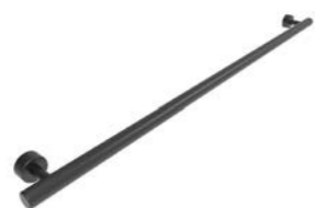
Post and Rail Powder Coated