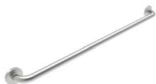
Return Handrail Brushed Stainless