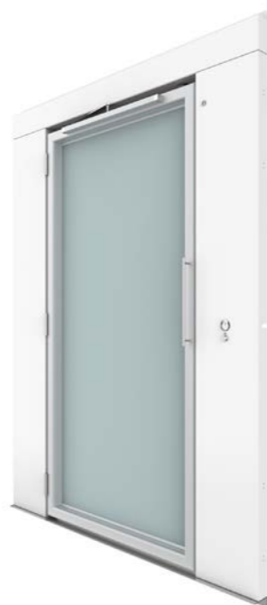
Powder Coated Swing door with translucent glass