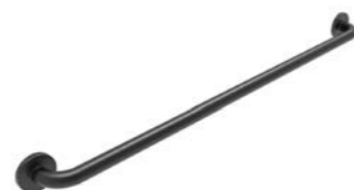
Return Handrail Powder Coated